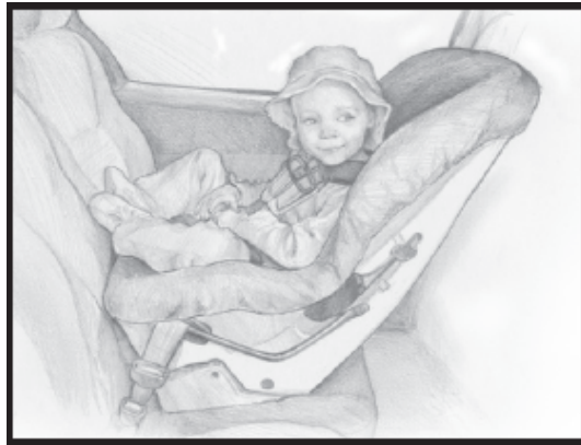
Figure 3: Convertible car seat used rear-facing.