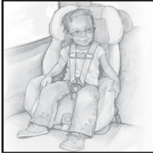
Figure 5: Forward-facing car seat only.