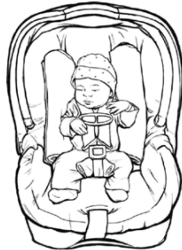
Figure 4: Car seat with a small cloth between crotch strap and infant, retainer clip positioned at the midpoint of the infant's chest, and blanket rolls on both sides of the infant.