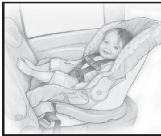
Figure 2: Rear-facing car seat.