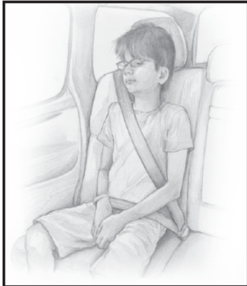
Figure 7: Lap and shoulder seat belt.

Seat belts are made for adults. Your child should stay in a booster seat until adult seat belts fit correctly ( usually when the child reaches about 4 feet 9 inches in height and is between 8 and 12 years of age ). When children are old enough and large enough to use the vehicle seat belt alone, they should always use lap and shoulder seat belts for optimal protection.